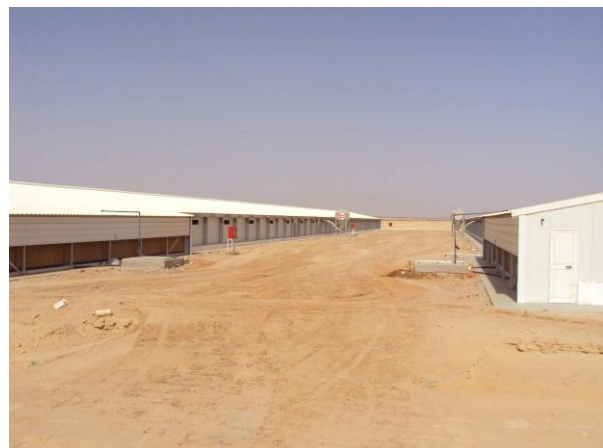
A view of some nearly completed rearing houses. Note the size of the wet wall.

It goes without saying that all houses are fully environmentally controlled and temperature is easily maintained at a steady 24 °C. In addition, they contain all of the latest equipment such as 360° nipples and Genesis feeder pans for rearing. All equipment has been supplied and installed by Chorettime. The general manager, Tom Warren, who is an old friend of many South Africans, explains that having large flocks with many houses allows for the attainment of excellent flock uniformity. The initial grading is carried out at 3-4 weeks of age and the flocks are allocated as specific, uniform weight groups to each of the seven houses at this early age. The controlled environment, together with the excellent uniformity, has meant that some of the first flocks through the site have peaked at over 88% production. Both Hubbard and Cobb birds are used.