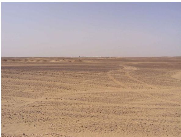
A poultry site in the middle of the Sahara! (Photograph to scale!)

Some 300 km south of Cairo in Egypt, near the city of El Minya, deep in the hostile Sahara desert, there lies the most amazing poultry project that I have ever seen. This is the site of Dakahlia Poultry Company's new broiler breeder operation. This bold move to establish in the desert was initiated in order to isolate the Company's strategic hatching egg production from the dreaded Avian Influenza-plagued Delta region.